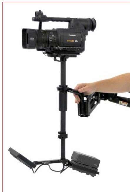
(ABOVE) The Flyer-LE with the Panasonic P2 camera complement each other perfectly.