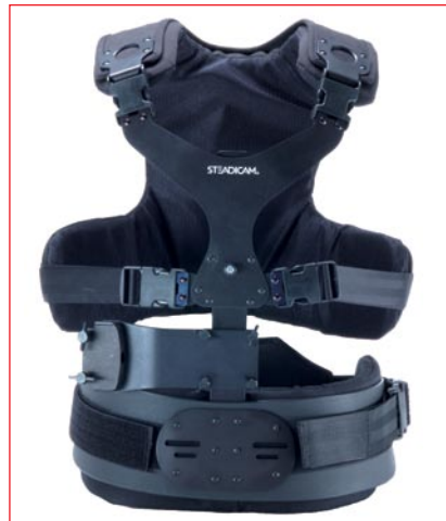
(ABOVE) Flyer-LE Vest.